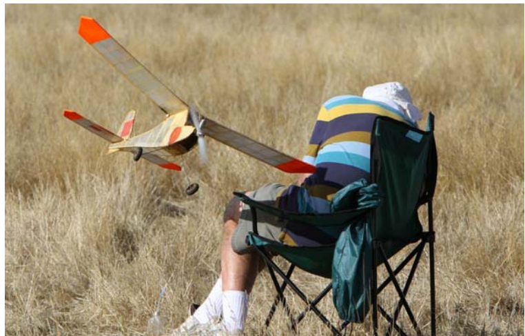
Fig. 5 Des Slattery quickly averts a glancing blow by Wally Bolliker's Ballerina, slowly circling the field.

it is not uncommon for places to be separated by just a few seconds.