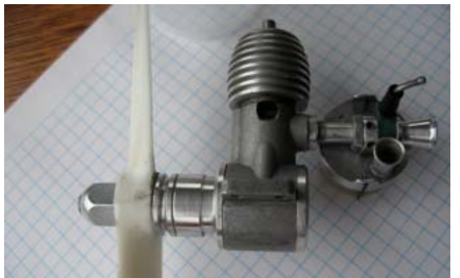
Fig. 7 (above) Modified Mills 0.75 cc used by author, note special BB front end. (below) New induction and tank system, with peripheral jet carburetor (a la Cox) and quick filling device.