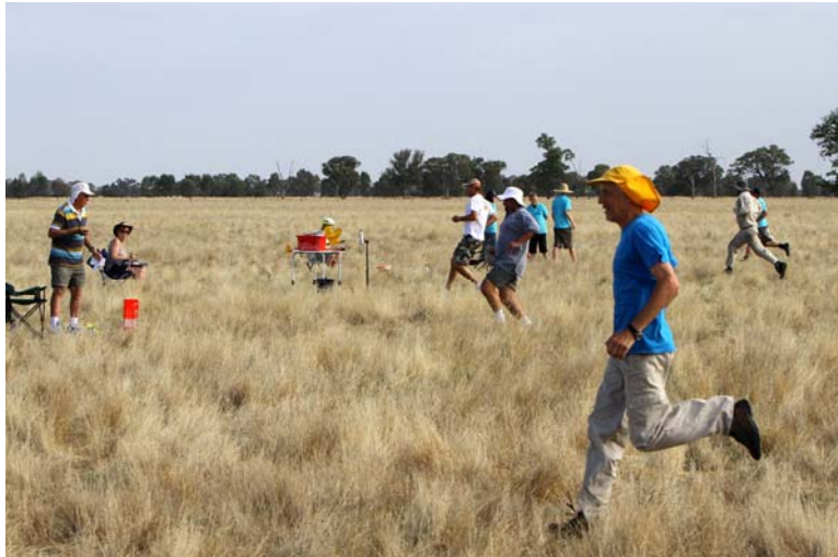
Fig. 4 Le Mans start of the Scrambles event!

At the end of the hour most pilots are happy to hear the CD call "Stop all watches". If you have been trying to win, you will be very exhausted. There is usually a wait while the CD adds up the scores of each contestant and the models are returned to the line and runners are able to relax. The places are then announced from last to first, and