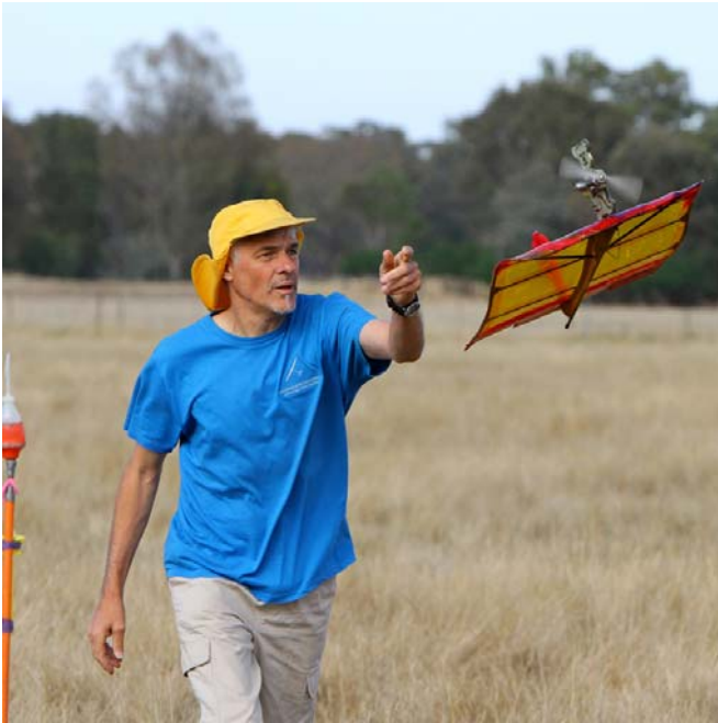
Fig. 1 The author launching his distinctive “Kanga” flying carpet model, one that has obtained many triumphs in this event. More details in text, page xx.