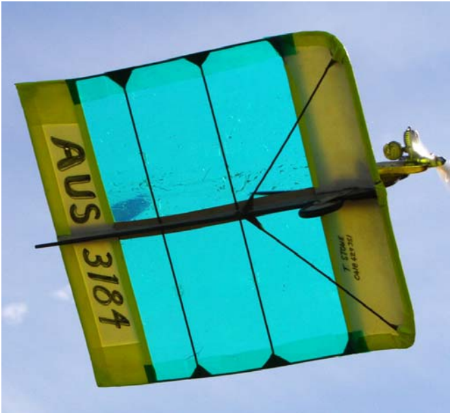
Fig. 6 Stowe's Kanga, showing (above), its robust wing structure and (above right) unique "Australian" profile: 'roos and beer. Note the thin, reflexed airfoil of this flying wing model, quite stable in spite of lack of dihedral. (right) Mills 0.75 is side-mounted on the kangaroo pylon, adjustable for downthrust.