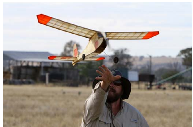
Fig. 2 Wally Bolliger and his Ballerina Scramble model

The event involves any number of entrants (we used to get 40-50 back in the day) and lasts exactly one hour. The object is to amass the most time in the air within the hour. The max is 120 sec and the minimum flight time is 15 sec. You are allowed one helper (usually a good runner) to help retrieve the model. The rules state that you are allowed to use any free flight model with a maximum en-